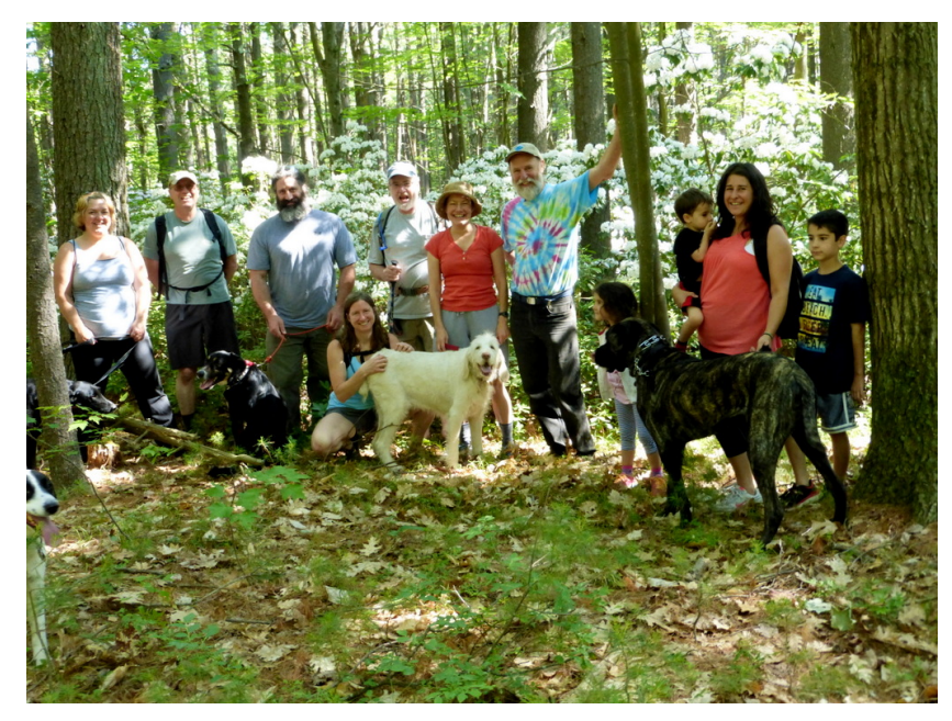
Ashby Land Trust Mountain Laurel Hike at Willard Brook